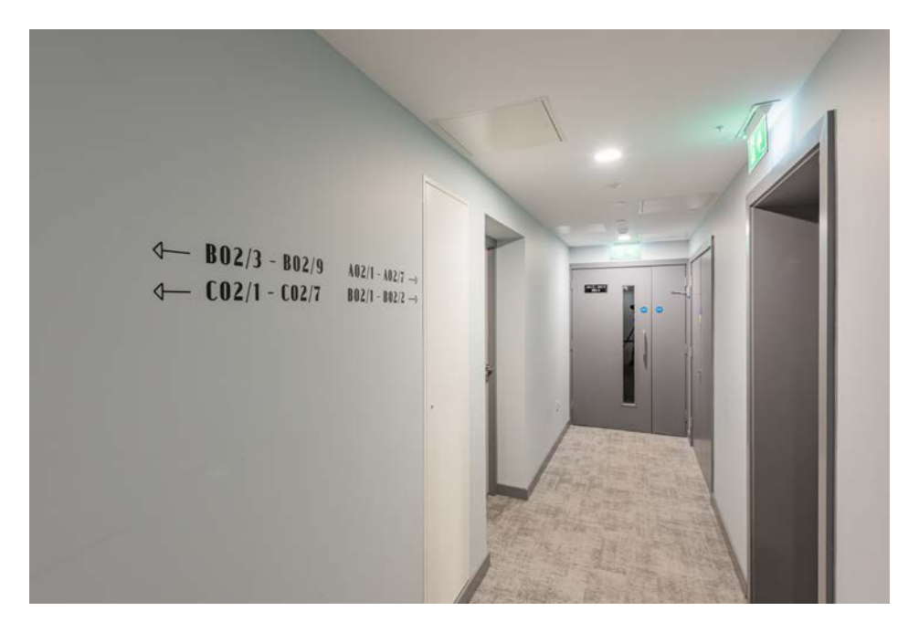
Digitally printed vinyl Mactac Pro letters have been supplied throughout the building to help users navigate to appartments and key facilities.

We supplied overhead 2mm thick aluminium folded tray signs with vinyl graphics applied to the face. 50mm thick aluminium bang bars hang on heavy duty brass plated hanging chains.