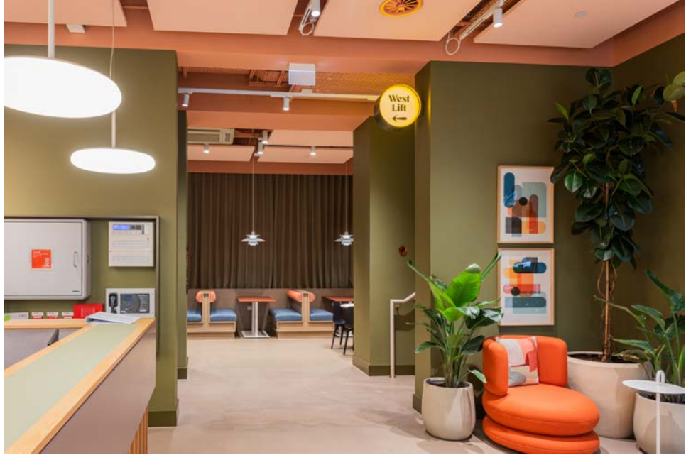
We have supplied a double-sided aluminium projecting sign with a Verometal coating applied and 3form Chroma Shrimp recessed panels.